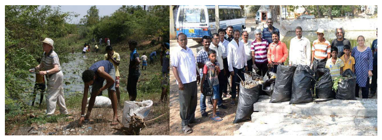
Pond cleaning in Nadukuppam, on March 20<sup>th</sup> for the Happiness day, co-organized with IDEF India with the participation of the General Consul of France and artists (right) and in Thengathittu Feb 22<sup>th</sup> (left)

Rehabilitation and maintenance of the water bodies is a big challenge. Local community and AllforWaterAll collective carried out tank cleaning in several places during the festival.