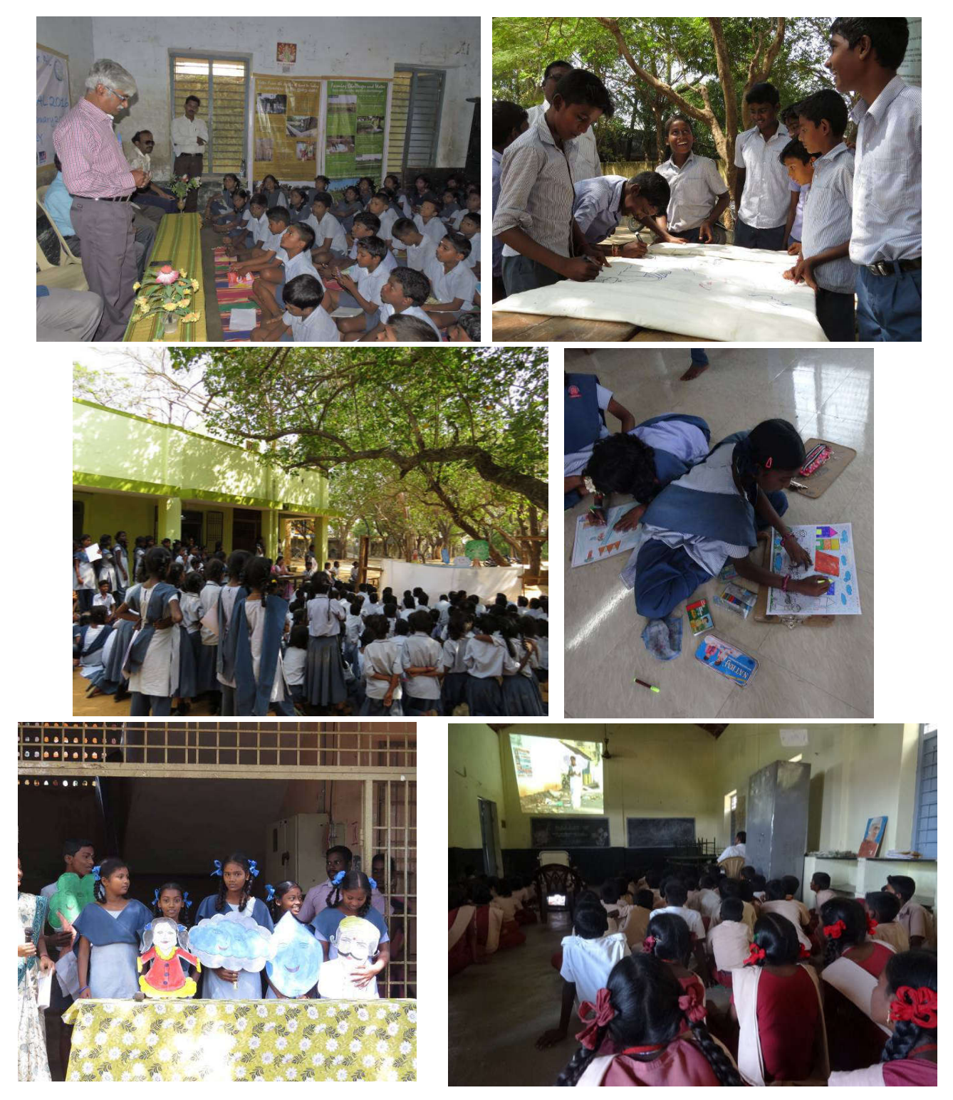
Ariankuppam, Feb. 16<sup>th</sup> (up left) ; Koravall, writing on the gada cloth, Feb. 4<sup>th</sup> (up right) ; Katterikuppam, March 2<sup>nd</sup> (middle left); Drawing competition in Uruvaiyar, March 3<sup>rd</sup> (middle right); Puppet show in Keezhparikkalpet, Feb. 8<sup>th</sup> (down left), Movie show in Nesal, Vanur, March 10<sup>th</sup> (down right)

We had a massive outreach program to create an effective awareness about water in the entire bioregion. In 39 schools, Teachers and AllforWaterforAll members addressed the kids and carried out activities: drawing, painting, puppet show, drama, movie showing, singing etc. The children were so energetic, aware of the issues related to water and they were READY and prepared to act .