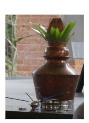
The Neer Kudam

The festival had an unusual and wonderful concept of bringing together the waters of the seven sub regions and unifying them as a symbol of care, connect and change. The Neer Kudam (water pot) represented our deep connection with water and with each other. During the seven weeks, it travelled to all the sub regions, being filled with water from each of these regions.