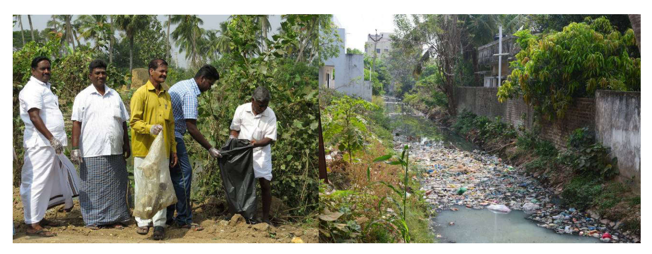
Tank Cleaning in the Bahour sub-region Feb 7th (Left) and one of "Our" irrigation Channel (right)

The water resources in the PAVC bioregion face a host of serious threats all of which are caused primarily by human activity: pollution from urban, industrial and other waste, decreasing ground water recharge due to conversion of agricultural lands for other uses, encroachment of water bodies due to population growth, salt water intrusion into ground water due to coastal erosion and over extraction, exploitation & commercialization of water by private companies and the impacts of climate change, to name a few.