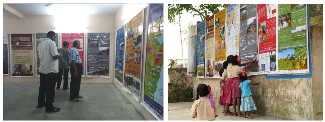
Travelling exhibition - Pondicherry Gandhi Thidal on Feb. 19th (left) and Cuddalore on Feb 9th (right)

AllForWaterForAll worked on building a knowledge base, taking up research and studies, organizing consultation meetings and capacity building programs and looked into starting education curriculums in schools. During the festival, an exhibition circulated in the bioregion , several seminars and meetings were organized .