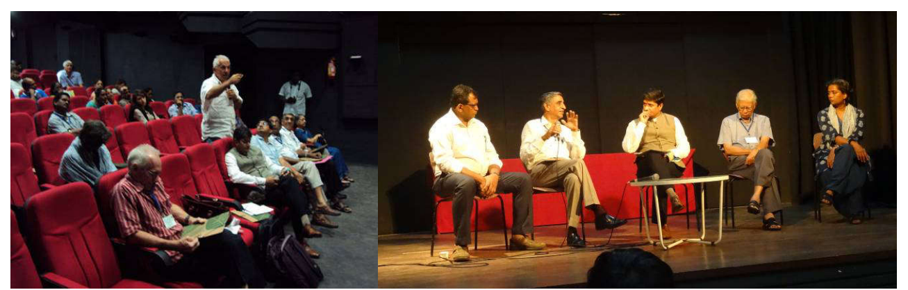
Meeting on The state of Lakes and Waterbodies of Southern India: Threats, Challenges and Opportunities', Feb. 29th

A one day meeting on 'The state of Lakes and Waterbodies of Southern India: Threats, Challenges and Opportunities' was held on 29 February, 2016, jointly organized with the Centre for Science and Environment (CSE). Experts from different parts of South India came together to discuss the reasons of major urban floods in India. This forum brought together around 70 participants from Pondicherry, Madurai, Nagarcoil, Hyderabad, Chennai, and Bengaluru to be a part of the event. They shared the view that lakes and waterbodies of India are in a poor state and dying under the threat of urbanization.